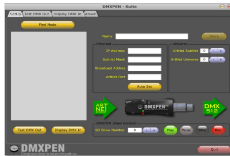
c. PenSuite start up

Once installed, launch PenSuite. Remember that Firewall system can cause incorrect operation.