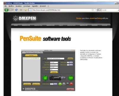
a. Install PenSuite software on your PC

N.B. Remember to stop any running playback pressing the on board button before to start a recording session