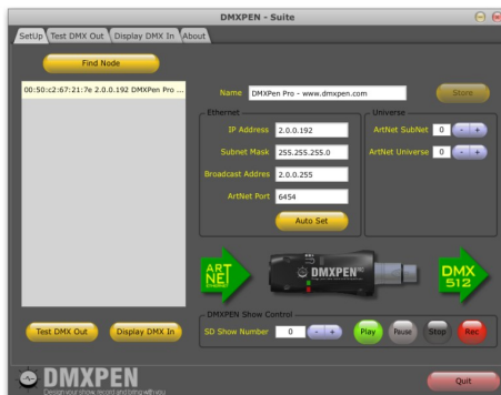
d. DMXPen network scan and mode selection